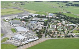
Whenuapai Airforce Base