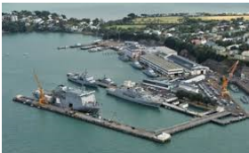
Devonport Naval Base