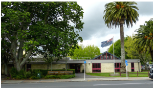
Papakura Army Base